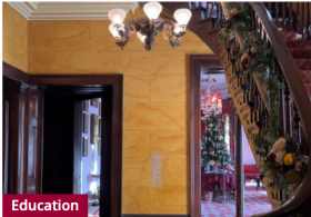
Victorian Christmas at Dundurn Castle