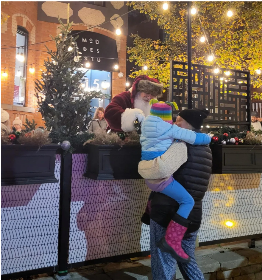
Santa visits with his fans.