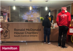
Ronald McDonald House lights up for the Holidays