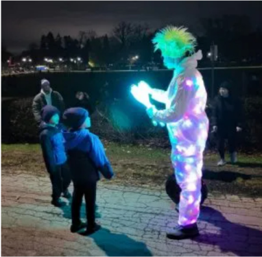
Visitors watched as the juggler lit up the night.

According to Hamilton Food Share, they received almost 2000 kg of donated food items and raised $13,863 to help support community members facing food insecurity. The CPKC Holiday Train donated $10,000 during its stop in Hamilton.