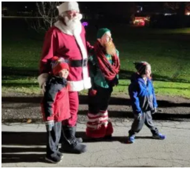
Santa and his elf posed for photos with their fans while waiting for the CPKC Holiday Train to roll in.