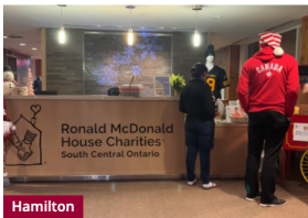
Ronald McDonald House lights up for the Holidays