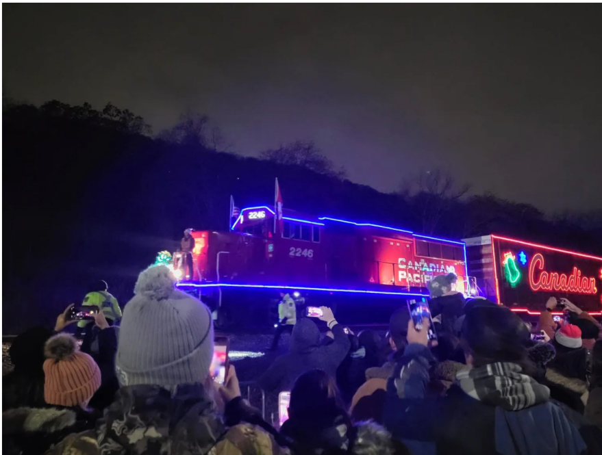
The CPKC Holiday train spans over 300 meters long, with 14 rail cars individually decorated with a different LED Christmas light display.

People flocked to Gage Park in the thousands on Wednesday (Nov. 22) when the CPKC Holiday Train rolled up the South tracks ahead of schedule at 7:30 p.m. The train ran more than 300 meters along 14 decorated rail cars with LED Christmas light displays that would dance in unison with the holiday music playing in the background.